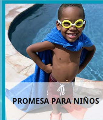
PROMESA PARA NIÑOS